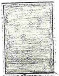
Full Page 7 1/2" x 10" $175.00 – Black & White