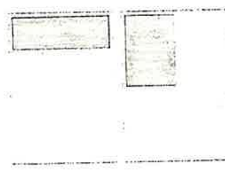
Quarter Page 7 1/2" x 2 1/2" (horizontal) or 3 3/4" x 5" (vertical) $60.00 – Black & White