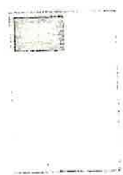
Eighth Page 3 3/4" x 2 1/2" $40.00 – Black & White

The inside front and inside back cover, as well as the back cover will be available at a special cost and on a limited basis