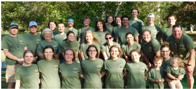
2024 Counselors and Staff