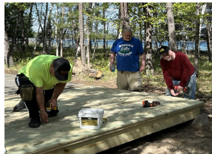
Repairing the Stage