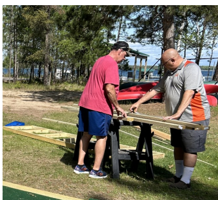
Rebuilding the Mini Golf Course